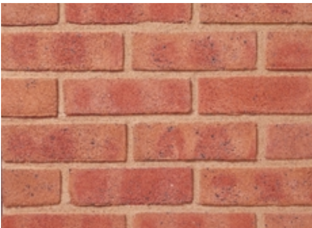
CADMIUM RED BRINDLE FLECKED