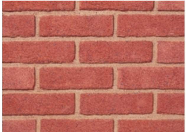
CADMIUM RED FLECKED