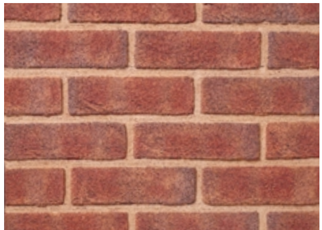
SIENNA RED BRINDLE