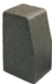
Fig 7 Kerb